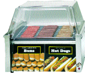
Model 30SCBD with Sneeze Guard