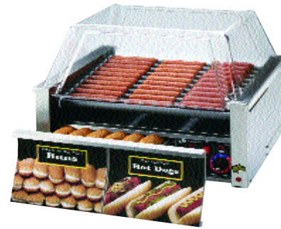
Model 50CBD with Sneeze Guard