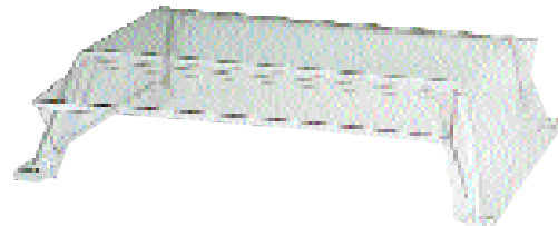
Model 45SG-FCA with optional SGS Sneeze Guard Shields