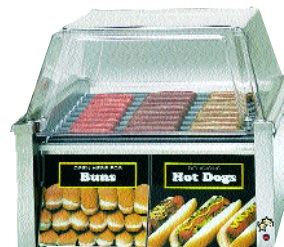
Model 30SCBD with Sneeze Guard