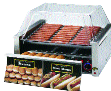
Model 50CBD with Sneeze Guard