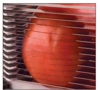
Blades are razor-sharp stainless steel for a smooth, precise cut.