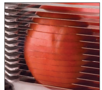
Blades are razor-sharp stainless steel for a smooth, precise cut.