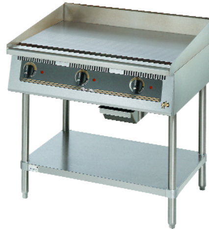
Model 736T Shown with Optional Floor Stand