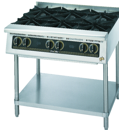
Model 806H Shown with Optional Floor Stand