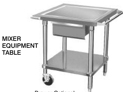
MIXER EQUIPMENT TABLE