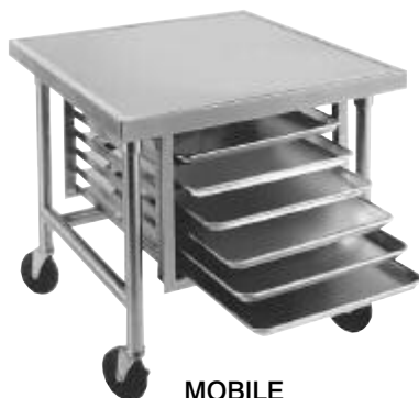
MOBILE MIXER TABLE