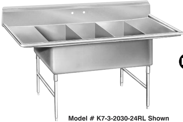
Model # K7-3-2030-24RL Shown