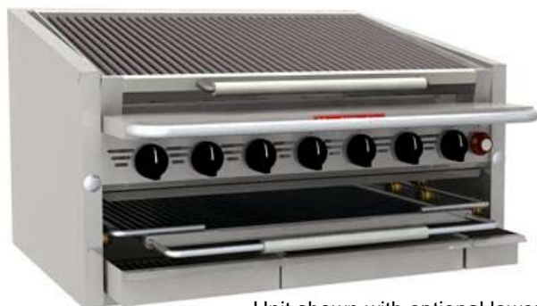
Unit shown with optional lower rack