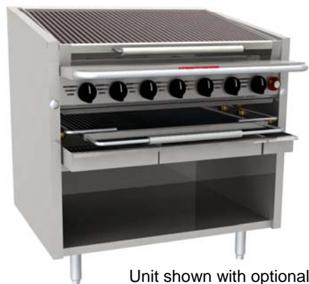
Unit shown with optional lower rack