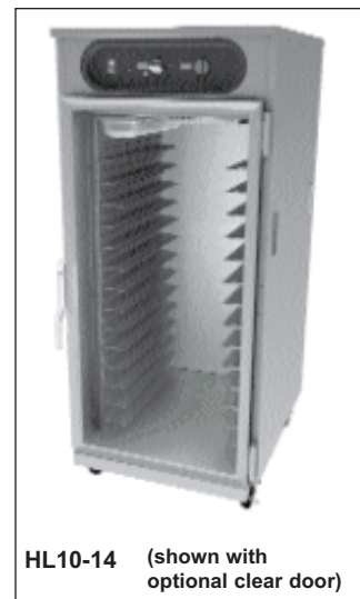
HL10-14 (shown with optional clear door)