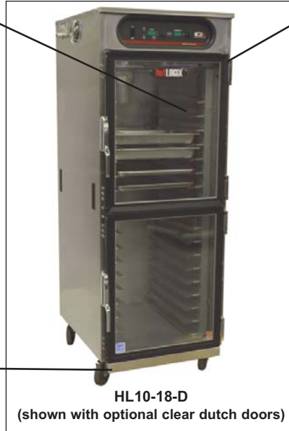
HL10-18-D (shown with optional clear dutch doors)

STAINLESS STEEL DRIP TROUGH... Located at base of door to catch condensation. Easy to remove sliding keyhole design for emptying and cleaning.