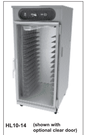
HL10-14 (shown with optional clear door)