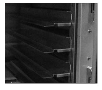
Optional stainless steel adjustable universal slides