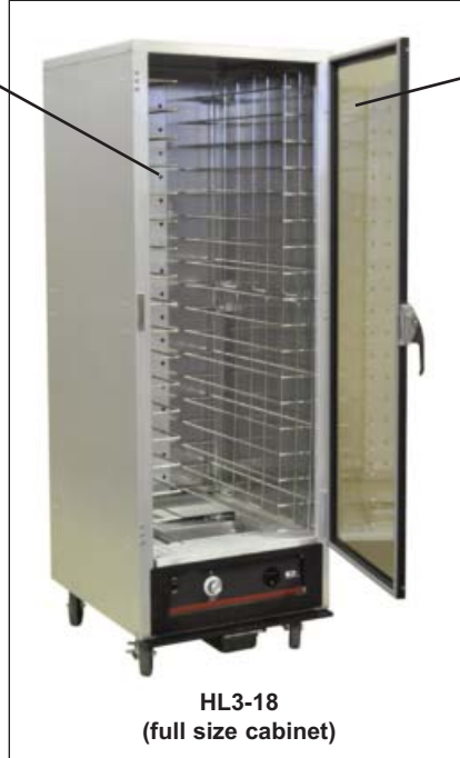
HL3-18 (full size cabinet)

FOUR SIZES... HL3 series cabinets are available in under-counter, 1/2 size, 3/4 size and full size.