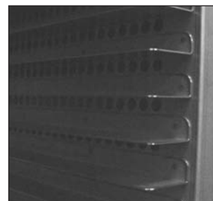
Optional fixed angle slides