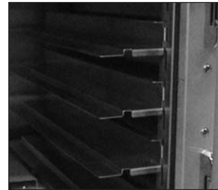
Optional stainless steel adjustable universal slides