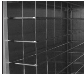
Standard universal wire slides

PAN SLIDES... Universal wire slides at fixed spacing of 3". Assemblies removable. Hold 18"x26" sheet pans, 12"x20" steam table pans, 2/1 or 1/2 G/N pans. Adjustable universal stainless steel pan slides or fixed angle slides are optional.