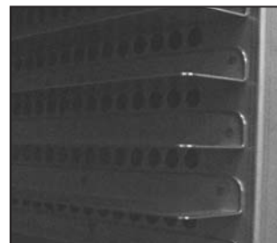
Optional fixed angle slides