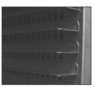
Optional fixed angle slides