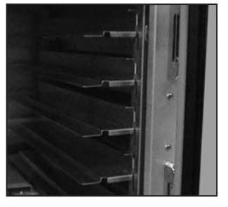
Optional stainess steel adjustable universal slides