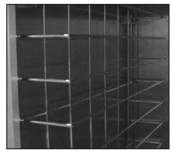
Standard fixed universal wire slides

PAN SLIDES... Universal wire slides at fixed spacing of 3". Assemblies removable. Hold 18"x26" sheet pans, 12"x20" steam table pans, 2/1 or 1/2 G/N pans. Adjustable universal stainless steel pans slides or fixed angle slides are optional.