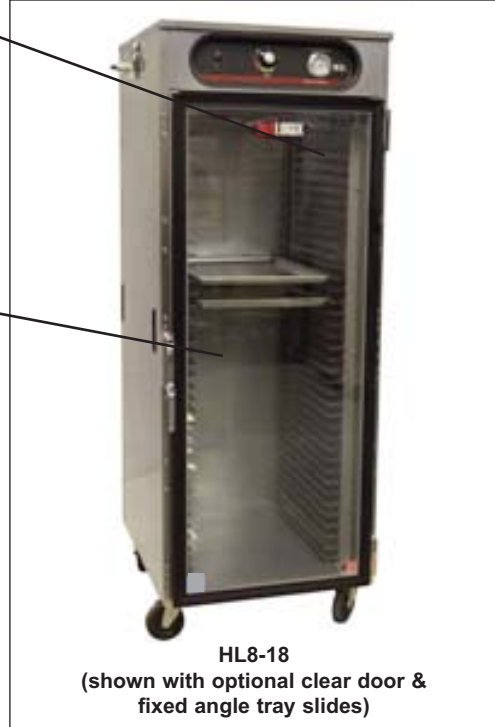
HL8-18 (shown with optional clear door & fixed angle tray slides)

EASY-TO-USE DIGITAL CONTROLS... Control heat with dial. Temperature range of 85°F to 200°F. Flashing display during preheat mode, turns solid when preheat mode is complete. Temperature display shows user setting. Press temperature dial to display actual temperature. Low temperature light with audible alarm.