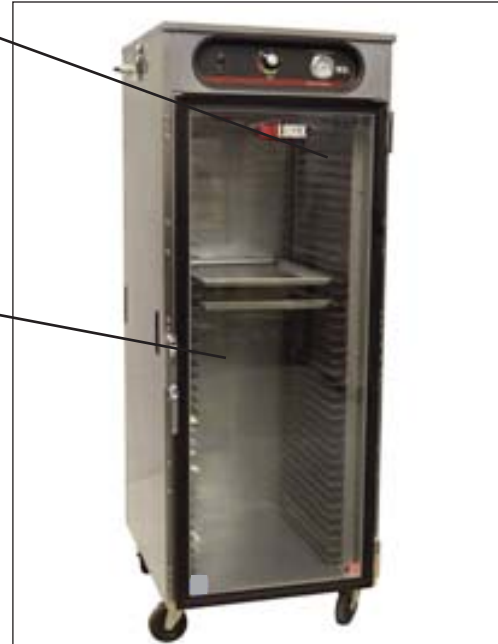
HL8-18 (shown with optional clear door & fixed angle tray slides)

EASY-TO-USE DIGITAL CONTROLS... Control heat with dial. Temperature range of 85°F to 200°F. Flashing display during preheat mode, turns solid when preheat mode is complete. Temperature display shows user setting. Press temperature dial to display actual temperature. Low temperature light with audible alarm.