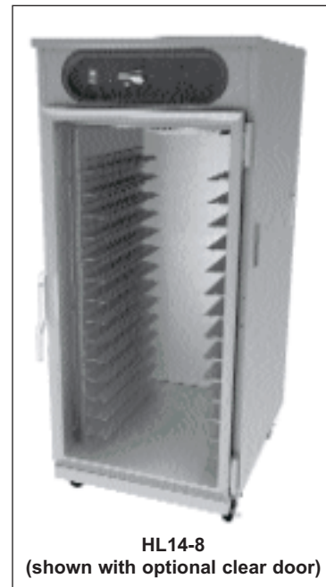
HL14-8 (shown with optional clear door)

1551 McCormick Avenue, Mundelein, Illinois 60060 Tel. (847)362-5500 • (800)323-9793 • Fax (847)367-8981 www.carter-hoffmann.com