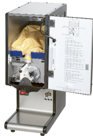
Model HPDE1 (cheese not included)