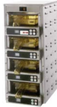
MC1W4H (shown with optional pans)

REMOVABLE FOOD COVERS... Removable stainless steel lids, notched and held in place by gravity. Prevent moisture loss and food deterioration and allow extended holding times. Easily removed for holding drier foods and cleaning.