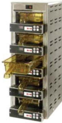
MC1W5H (shown with optional pans)

Since 1947, Foodservice Equipment That Delivers!