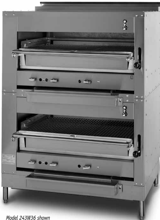
Model 243W36 shown