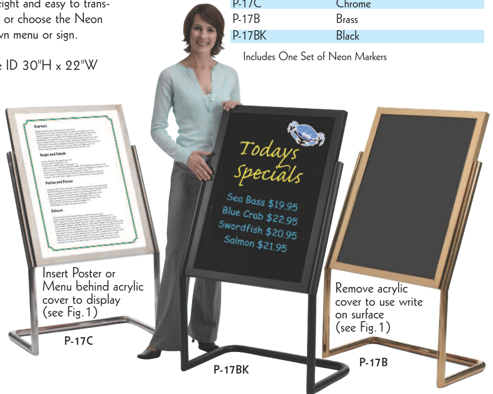
Insert Poster or Menu behind acrylic cover to display (see Fig. 1)