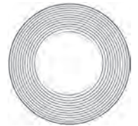
RA-21 Maxxi Rim Plate 12 1/8" / 30.8 cm / 1 dz 35 lb / 15.9 kg