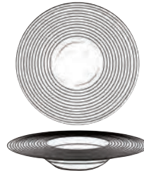
RA-26 Deep Soup Maxxi Rim 10 5/8" / 26.9 cm 12 oz / 355 ml / 1 dz 31 lb / 14 kg