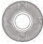
RA-2 Saucer 6" / 15.2 cm / 3 dz 20 lb / 9 kg