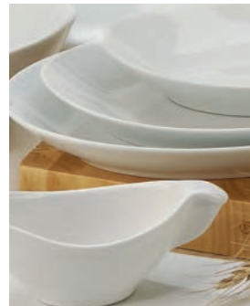
CO-13 11 1/4" x 7 3/8" 28.5 cm x 18.7 cm / 1 dz 19 lb / 8.6 kg