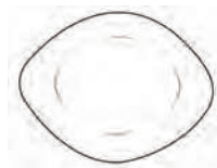
CO-W13 Plate 12" x 9 1/2" 30.4 cm x 24.1 cm / 1 dz 22 lb / 10 kg