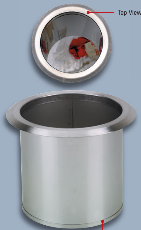
TCD-2NB Hemmed bottom, no sharp edges