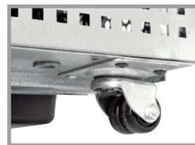
1½" diameter dual swivel castors for "LP" models.