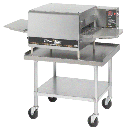
UM-1833A with Optional Stand

Star's Holman Ultra-Max electric conveyor ovens are covered by Star's one year parts and labor warranty.