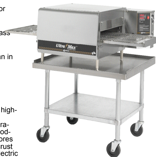
UM-1850A with Optional Stand