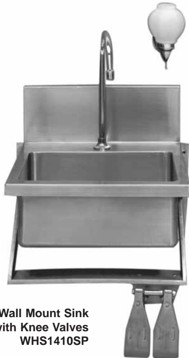
Wall Mount Sink with Knee Valves WHS1410SP