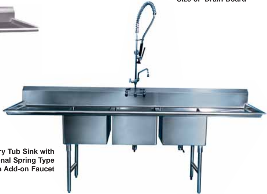
Triple Bakery Tub Sink with Optional Spring Type Pre-Rinse with Add-on Faucet