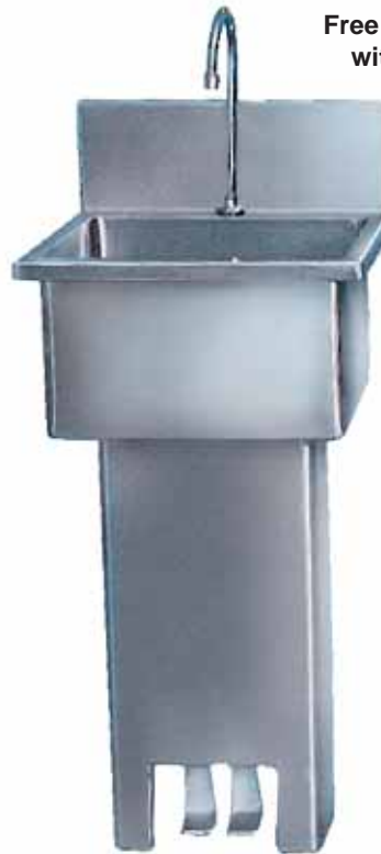
Free Standing Sink with Foot Pedals WHPS1616