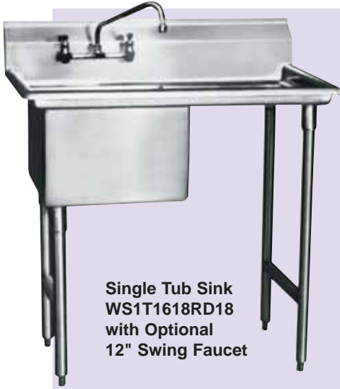
Single Tub Sink WS1T1618RD18 with Optional 12" Swing Faucet

For preparation and processing in all Food Service environments.