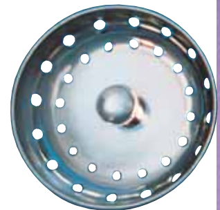
Basket Drains for all Sinks