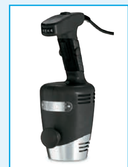
WSBPP Power pack fits entire Big Stik® Heavy-Duty Immersion Blender line