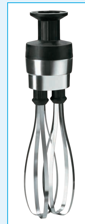
WSB2W 10" Stainless Steel Whisk Attachment fits entire Big Stik® Heavy-Duty Immersion Blender line

Waring makes it easy to do more than just blend. The 10" Stainless Steel Whisk Attachment quickly transforms the Big Stik® into a gentle giant as it whips delicate egg whites, creams to any consistency and mashes potatoes in record time with its heavy-duty construction. The bowl clamp lightens the load for hands-free operation while the wall-mount hanger provides an easy storage option.