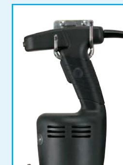
WSB01 Wall-mount hanger available for easy storage while unit is not in use